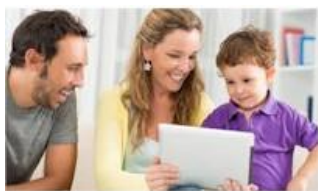
Parents email observations to the school