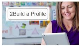
Teachers approve and enhance the observations